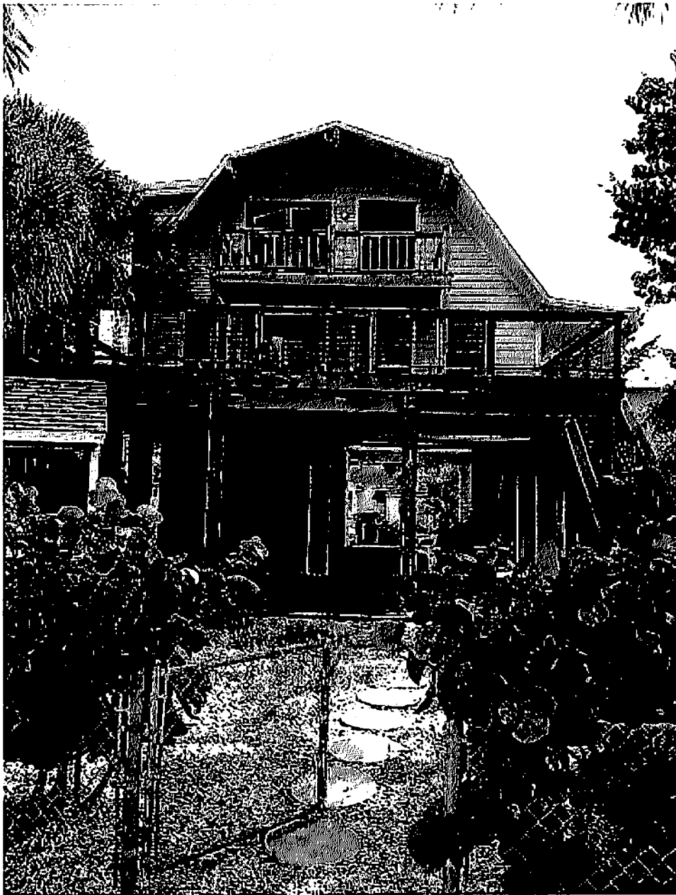
REAR VIEW SEPT 14, 2014

If submitting more photographs than will fit on the preceding page, affix the additional photographs below. Identify all photographs with: date taken; "Front View" and "Rear View"; and, if required, "Right Side View" and "Left Side View." When applicable, photographs must show the foundation with representative examples of the flood openings or vents, as indicated in Section A8.