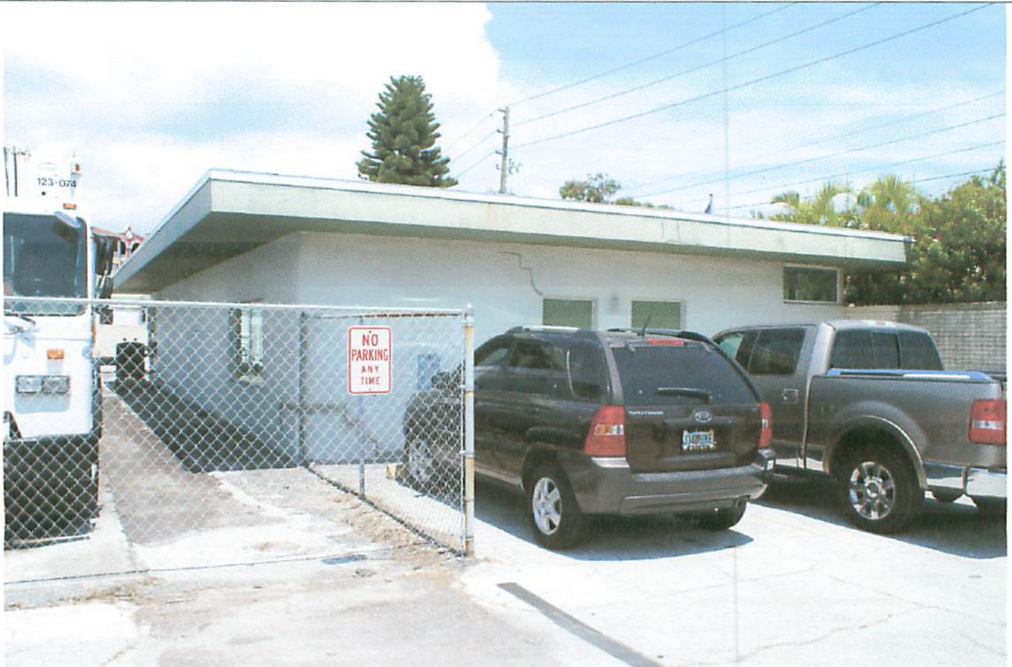
BACK with AC visible 8-01-14

If submitting more photographs than will fit on the preceding page, affix the additional photographs below. Identify all photographs with: date taken; "Front View" and "Rear View"; and, if required, "Right Side View" and "Left Side View." When applicable, photographs must show the foundation with representative examples of the flood openings or vents, as indicated in Section A8.