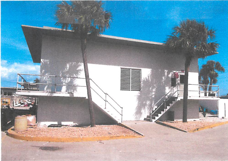
Photo One Caption FRONT VIEW

If using the Elevation Certificate to obtain NFIP flood insurance, affix at least 2 building photographs below according to the instructions for Item A6. Identify all photographs with date taken; "Front View" and "Rear View"; and, if required, "Right Side View" and "Left Side View." When applicable, photographs must show the foundation with representative examples of the flood openings or vents, as indicated in Section A8. If submitting more photographs than will fit on this page, use the Continuation Page.